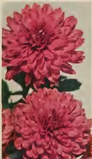
VIOLET 50c each; 3 for $1.25